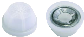
Wald Snap On Caps 376-033