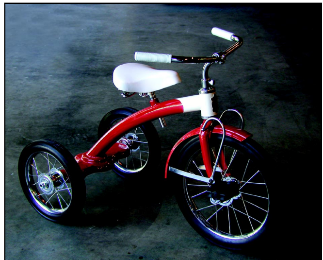
Colson 16" Pedal Drive 620-216