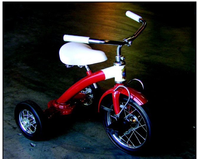
Colson 12" Pedal Drive 620-212

Kool-Stop International now offers four styles of the Colson replica tricycle drop-shipped through Wilson Bicycle Sales.