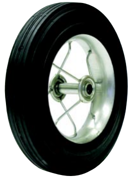
Samuelson Rear Tricycle Wheel 376-111