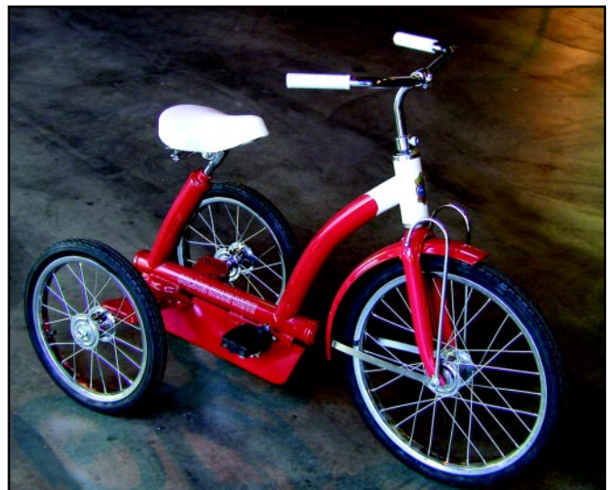
Colson 20" Chain Drive 620-220